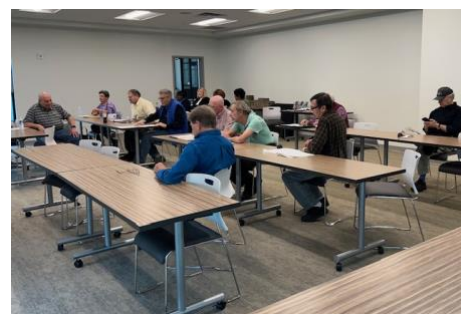
Planning the 2023 SRSRA Member Meeting